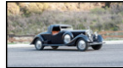
Actual photo taken

BACKGROUND: Rule #1-Do not, under any circumstance, shoot your car indoors. Also, do not shoot your car where there are distractions in the background that will deter from the focus of your car and its features (i.e. people, buildings, other cars, etc). Distant backgrounds (i.e. mountains, open fields, a wooded setting, etc.) will help keep your car in focus and blur out any background distractions. Also try to find a background that won't blend in with the color of your car, contrast is key. Please, no parking lines in the pics. It is vital that you leave an adequate amount of room around your car for the background so the photo may be placed properly in the catalogue. See example